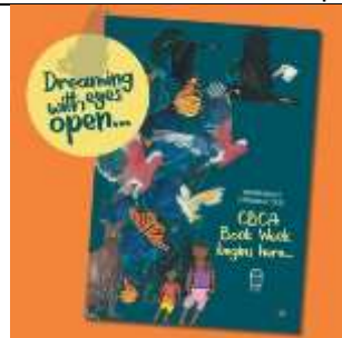
2022 CBCA Catalogue