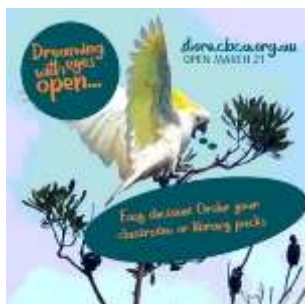
Classroom and library packs-buy packs and get a discounted price