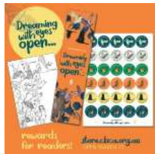
Rewards-colouring in sheet, bookmarks, stickers