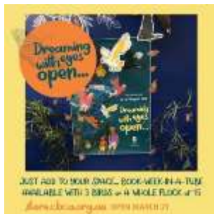
Book Week in a Tube - 2 sizes