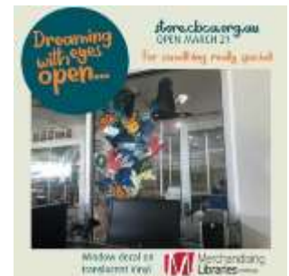
Vinyl window stickers to decorate your library, in several sizes