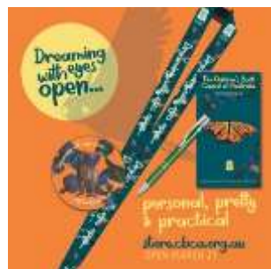
Buy these for yourself!

https://cbca.blob.core.windows.net/documents/Merchandise/Merchandise Catalogue 2022.pdf